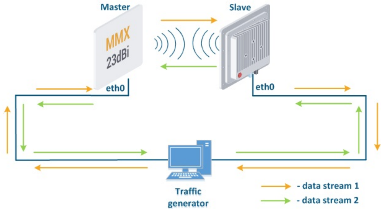
Figure - Bidirectional throughput test