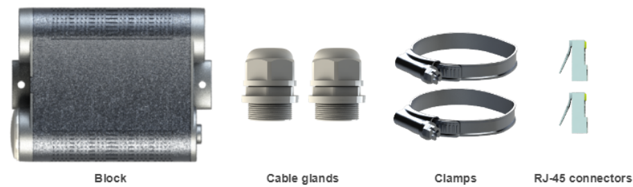
Figure - Packing list AUX-ODU-LPU-G

AUX-ODU-LPU-G is supplied with a worm clamp TORRO 40-60/9 C7 W4 DIN 3017 - 2 pcs. The clamp is made of stainless steel A4, width 9 mm, allows the installation on a mast with a diameter of 35 to 60 mm. In case of mast diameter more than 60 mm, a similar clamps (up to a 230 mm diameter) with a width of up to 12-13 mm can be used.