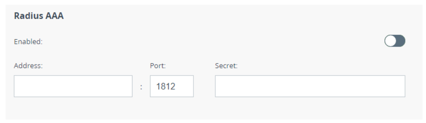
Figure - RADIUS parameters