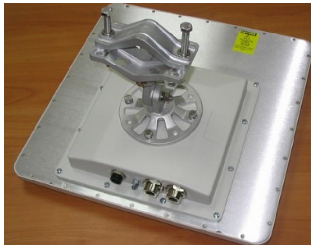
Figure - MONT-KIT-85 general view