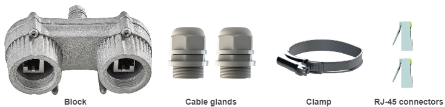
Figure - Packing list AUX-ODU-LPU-L

AUX-ODU-LPU-L is supplied with a worm clamp TORRO 40-60/9 C7 W4 DIN 3017. The clamp is made of stainless steel A4, width 9 mm, allows the installation on a mast with a diameter of 35 to 60 mm. In case of mast diameter more than 60 mm, a similar clamp (up to a 230 mm diameter) with a width of up to 12-13 mm can be used.