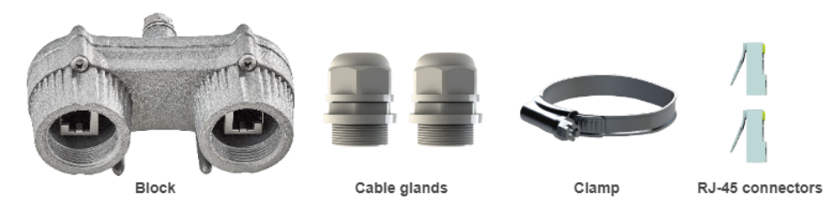
Figure - Packing list AUX-ODU-LPU-L

AUX-ODU-LPU-L is supplied with a worm clamp TORRO 40-60/9 C7 W4 DIN 3017. The clamp is made of stainless steel A4, width 9 mm, allows the installation on a mast with a diameter of 35 to 60 mm. In case of mast diameter more than 60 mm, a similar clamp (up to a 230 mm diameter) with a width of up to 12-13 mm can be used.